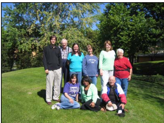
Members of the CAPSH 2005-2006 Energy Assistance team and volunteers.

Energy Assistance is available to both homeowners and renters who meet stated income guidelines. It is not necessary for the household to be facing a disconnection in order to receive help. Energy assistance is a grant, not a loan, so it does not need to be repaid.